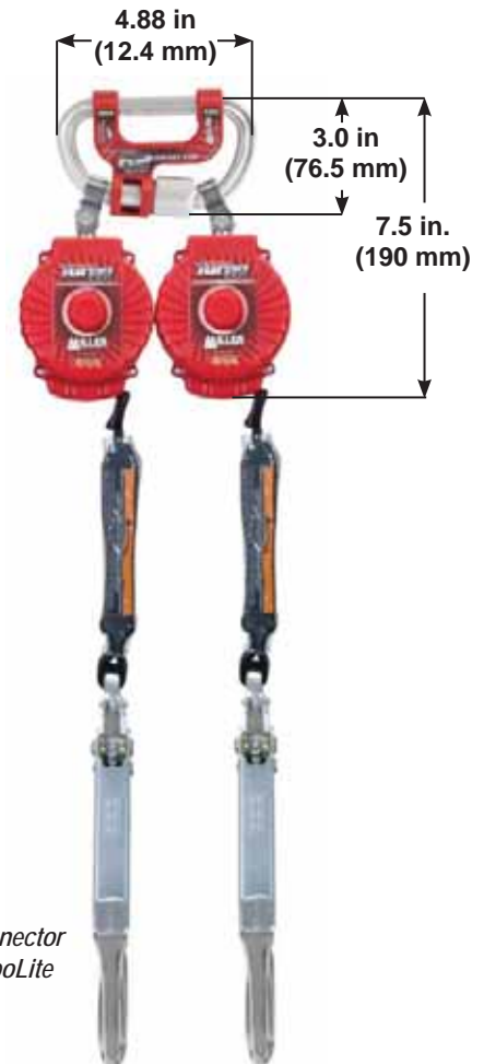
MFLC-4/6FT Twin Turbo G2 Connector & two (2) 6 ft. TurboLite PFLs

Twin Turbo Systems provide 100% continuous fall protection while working at heights.