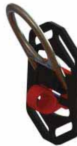
G2 D-Pad Clip* MFLC-3/ (*Included with all MFLC kits)