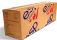
This product comes in a long box and contains 40 socks

These socks are 1.2 metres in length and eight centimetres in diameter. There are 40 socks in the branded cardboard box. The socks feature a spun-bond outer sleeve that has a durable heat sealed seam running its entire length. This tube is then filled with a next generation absorbent core that will absorb both oil-based and water-based fluids. The absorbent core is secured into the sleeve at each end with a durable metal clip.