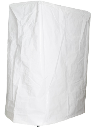
HZ-08 : Protective cover

Tool bag with hooks. Installs on the edge of the top frame.