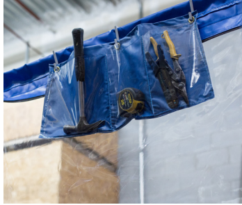
HZ-12 : Tool bag

4 ' extension kit to reach ceilings over 10'.