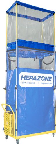
HZ-07 : 48" extension kit

4 ' extension kit to reach ceilings over 10'.