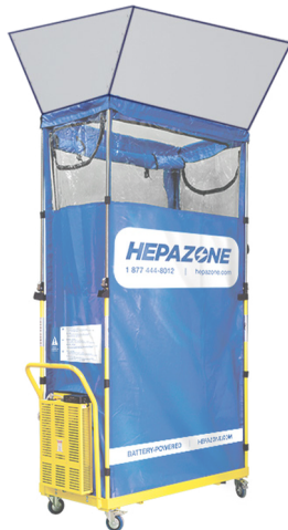
HZTA : Tile adapter

Protective cover to keep your HepaZone clean during storage.